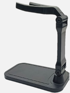
Universal Scanner Stand