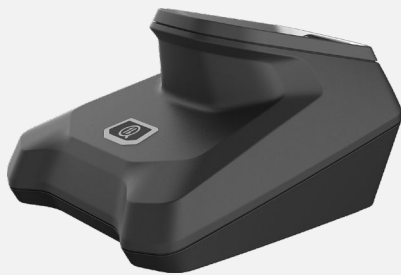
BT Charging Dock